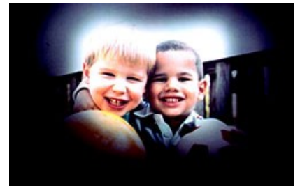
Glaucoma affects periphery vision.

Glaucoma is the second leading cause of vision impairment in America and the world (allaboutvision.com). It is a group of eye illnesses that damages the eye's optic nerve which transfers information from the eye to the brain (NEI). The damage is usually through ocular hypertension or pressure inside the eye. It affects the peripheral vision and can eventually lead to blindness. Glaucoma has a higher chance of affecting African-Americans, Hispanics, and Latinos depending on the type of glaucoma. Surgery, laser, or medication is used to treat glaucoma depending on the severity. An active lifestyle with regular exercise, a healthy diet, and not smoking can also help reduce the risk for developing this illness.