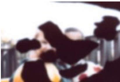
Diabetic Retinopathy causes dark, empty floating spots.

Diabetic Retinopathy is the leading cause of visual impairment and blindness among working-age adults (NEI). Diabetic Retinopathy is linked to type 1 or 2 diabetes. If diabetes is not managed, high sugar levels in the blood can block vessels in the retina and cut off blood supply (Mayo Clinic). This causes dark, empty floating spots, blurred vision, fluctuating vision, or impaired color vision. People that have had diabetes for a longer time develop a greater risk. Also, African-Americans, Native Americans, and Hispanics patients have a higher risk. Diabetic Retinopathy can be prevented through managing diabetes, blood sugar levels, blood pressure, and cholesterol, not smoking, and paying attention to visual changes.