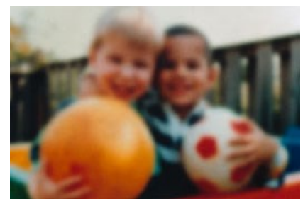
Cataracts cause blurred-cloudy vision.

Cataracts is common in the older population with more than half of all Americans suffering from this illness by the age of 80 (NEI). Cataracts causes a cloudy lens creating blurred vision. It makes driving, reading, writing, or seeing a friend's facial expression hard to see (WebMD). The beginning stages of cataracts can usually be corrected with lenses, however, as it progresses, surgery may be required. People who have diabetes, excessive exposure to sunlight, high blood pressure, are obese, smoke, or drink excessive amounts of alcohol have a higher risk of cataracts. Cataracts can be prevented or delayed if patients quit smoking, manage their health, and eat a healthy diet of fruits and vegetables.