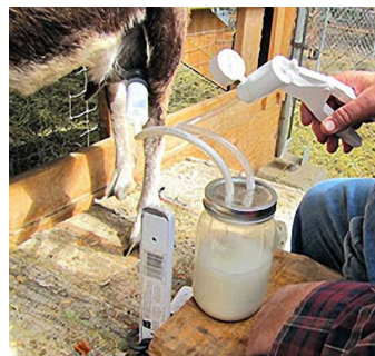
Henty Goat Milking Kit

According to the U.S. Bureau of Labor Statistics, CTS is responsible for nearly 30% of repetitive motion injuries at any workplace. This is likely higher in agricultural workplaces because hours are long and fast with many repetitive motions. CalAgrAbility can connect workers with assistive tools to enable workers to keep farming safely. One example is the Henry Goat Milking kit, it is designed to make milking easier on the hands and back. The vacuum pump enables pressing and lets you milk from any sitting position. Many more tools can be found through Ability Tools (see back). CalAgrAbility staff can help you coordinate to try tools from the Device Lending Library.